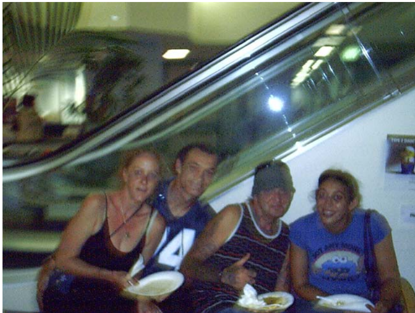
Figure 9 PWD ACT's free Pancake stall